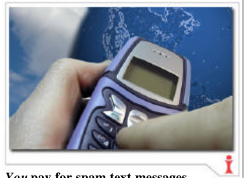
You pay for spam text messages.

1. Discuss the dangers with your kids and