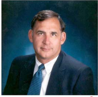
Congressman John Boozman (R-AR)