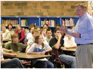
Senator Burns (R-MT) helping educate students on Internet safety in Billings, MT

We must adapt with the times. As students become more technologically savvy, we must continue to stay on our toes to protect them from the pitfalls of the Internet. I am pleased to stand here today and launch a program that will certainly keep all of our students safer and focused on school.”