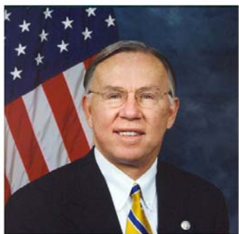
Congressman Ken Lucas (D-KY)