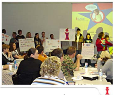
KY Students become i-SAFE Mentors and display their Internet safety posters

i-SAFE and Congressman Lucas commend the Kentucky students for being youth leaders in spreading Internet safety awareness and education throughout their state. We are honored to be involved with these motivated and ambitious young people.